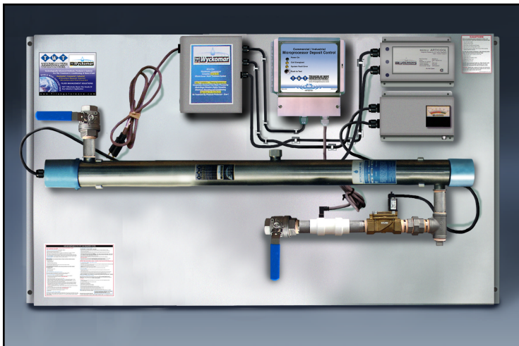
TWT-DP-05 (15 GPM)

Test proves Triangularwave Technologies (TWT®) Deposit Control System reduces the fouling effects caused by "hard water" on the quartz sleeve and UV lamp inside the disinfection/purification unit while maintaining the residual effects downstream chemically free.